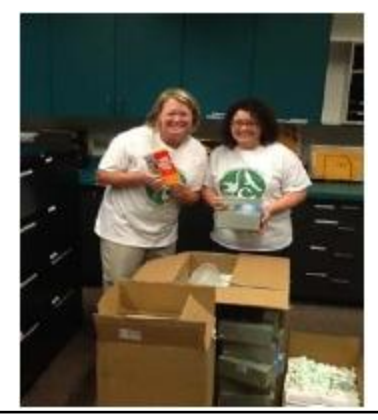
Binoculars and field guides arrive!

classroom set of high quality binoculars and field guides. Our previous set was almost 20 years old and showing a great deal of wear and tear. Because of Eagle Optics' generous school discount, we were also able to purchase curricular materials through the Cornell Lab of Ornithology. We also bought each 2<sup>nd</sup> grade classroom teacher a Wild About MN Birds resource guide. Lastly each student got his/her own copy of the Birds of the Northwoods Activity guide. This book is designed for students to complete activities and collect information about 50 different bird species. We also included time for the author of the book to visit classrooms, talk to