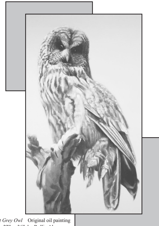
Great Grey Owl Original oil painting 22" x 36" by Rollin Alm