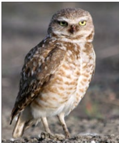
Record 2008-028, Burrowing Owl, 22 May 2008, Moorhead, Clay County.