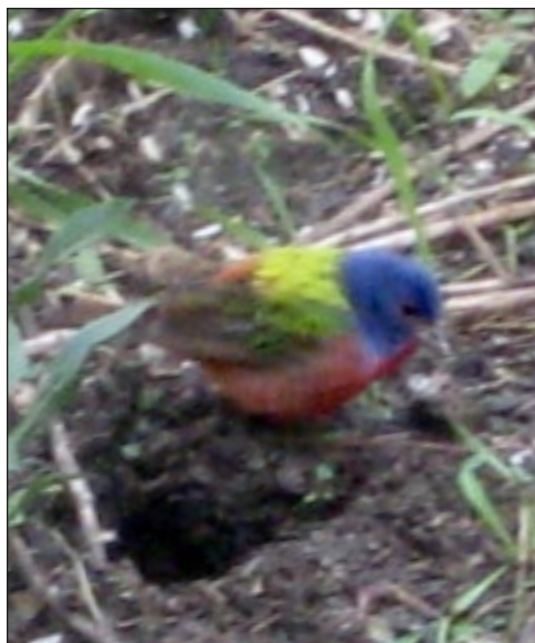
Record 2008-032, Painted Bunting, 13 May 2008, Lake City, Wabasha County.

ral Resources Office, Lake City, Wabasha County (record #2008-032, vote 7-0).