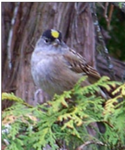
Record 2008-021, Golden-crowned Sparrow, 28 April 2008, Lutsen, Cook County.

• White-winged Dove ( Zenaida asiatica ), 16–22 April 2008, Lutsen, Cook County (record #2008-017, vote 7–0).