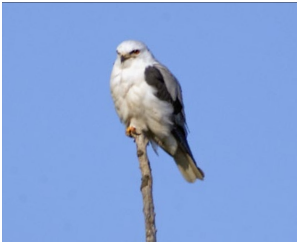
Record 2008-023, White-tailed Kite, 4 May 2008, near Austin, Mower County.

• Cinnamon Teal, 26 April 2008, Crookston Wastewater Treatment Ponds, Polk County (record #2008-020, vote 7–0).