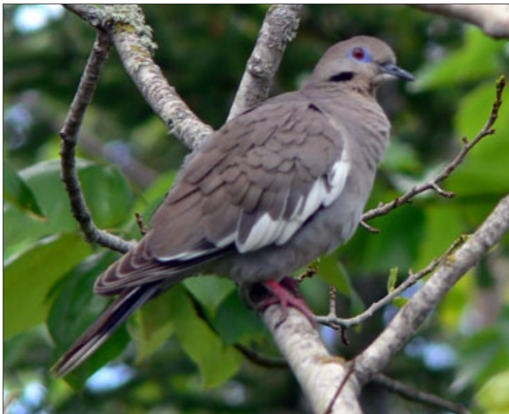
Record 2008-033, White-winged Dove, 15 June 2008, Grand Portage, Cook County.

25 May 2008, Straight River Marsh, Steele County (record #2008-030, vote 6–1).