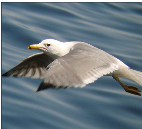
Record #2009-024. California Gull, 23 May 2009, Agassiz NWR, Marshall County.

• Arctic Tern ( Sterna paradisaea ), 13–14 May 2009, Lake Byllesby, Dakota County (record #2009-019, vote 7–0).