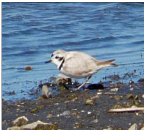
Record #2009-027. Snowy Plover, 30 May 2009, Agassiz NWR, Marshall County.