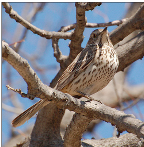
Record #2009-009. Sage Thrasher, 14 April 2009, Minneapolis, Hennepin County.