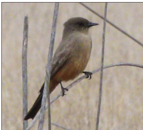
Record #2009-015. Say's Phoebe, 13 May 2009, Ramsey, Anoka County.

March 2009, Eagan, Dakota County (record #2009-005, vote 7-0).