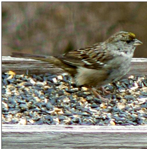
Record #2009-005. Golden-crowned Sparrow, 30 March 2009, Eagan, Dakota County.

experience with Bullock's Oriole. Since there were no field notes, sketches, or photographs, it was felt that a complete and unambiguous description would be needed to substantiate a potential second state record.