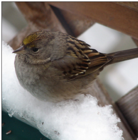
Record #2008-066. Golden-crowned Sparrow, 20 December 2008, Duluth, St. Louis County.