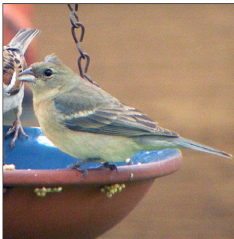
Record #2009-025. Lazuli Bunting, 26 May 2009, Star Lake, Otter Tail County.

extent of this feathering. The tail was described as “white with a rufous wash to it”, which fits either Ferruginous Hawk or western Red-tailed Hawk ( B. jamaicensis ). Field notes or a sketch showing the exact wing and tail pattern might have assuaged these concerns.