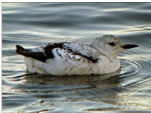
Record 2009-052, Black Guillemot, 7 November 2009, Taconite Harbor, Cook County.

mivorum ), 26 April 2009, Eloise Butler Wildflower Sanctuary, Minneapolis, Hennepin County (record #2009-045, vote 7-0).