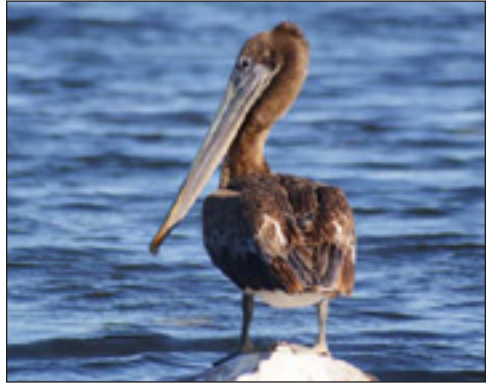
Record 2009-031, Brown Pelican, 27 June 2009, German Lake, Le Sueur County.

Adult male, photographed. During the Duluth Christmas Bird Count, what was probably the same bird was found at Leif Erikson Park; it subsequently overwintered and will be vot-