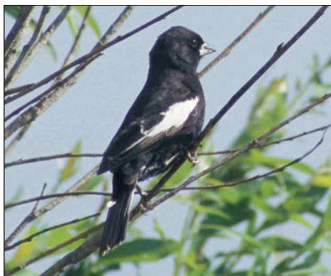
Record 2010-025: Lark Bunting, 28 May 2010, Agassiz NWR, Marshall County.

shall County (record #2010-015, identification Accepted 7-0).