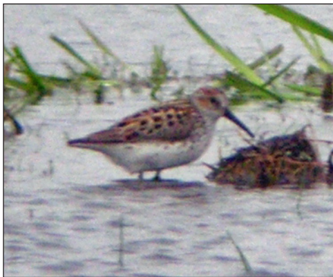
Record 2010-012: Western Sandpiper, 13 May 2010, Greenvale Township, Dakota County. Digital photo by Douglas W. Kieser.