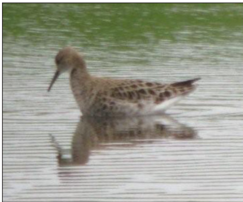
Record 2010-011: Ruff, 10 May 2010, Annandale, Wright County.