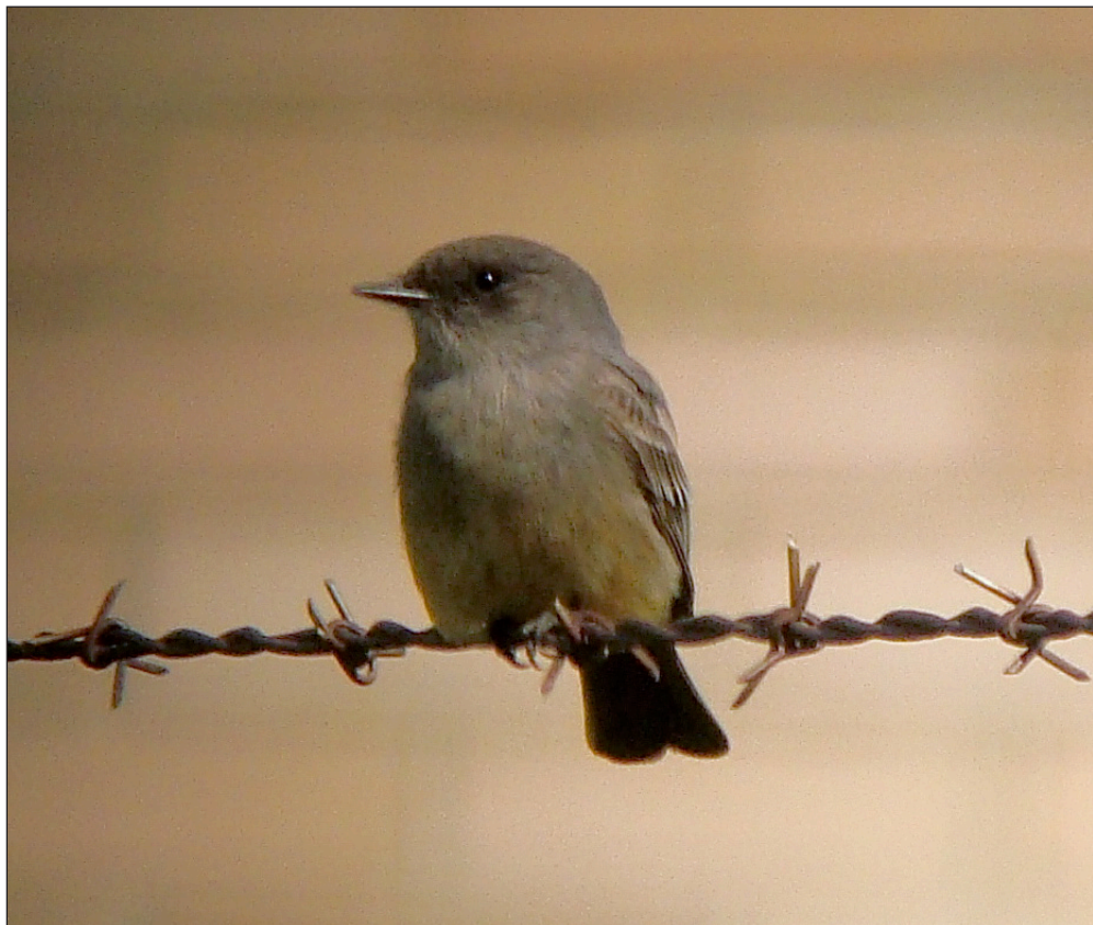
Record 2010-013: Say's Phoebe, 14 May 2010, Worthington, Nobles County.