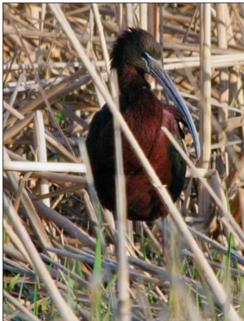
Glossy Ibis, 13 May 2014, Black Rush Lake, Lyon County.