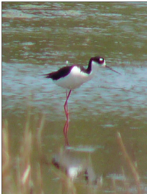
Black-necked Stilt, 24 May 2014, Herman, Grant County.

dominica ), 18 May 2014, Rochester, Olmsted County (record #2014-018, Casual, vote 7-0). Adult, photographed. First county record.