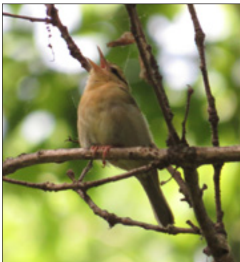
Record #2015-017, Worm-eating Warbler, 30 May 2015, Murphy-Hanrehan Park Reserve, Scott County.

• White-eyed Vireo, 20 May 2015, approximately 415 feet east of the state highway 56 bridge on the east edge of Adams in the pull-out on the north side of the road, Mower County (record #2015-019, vote 7–0). Adult.