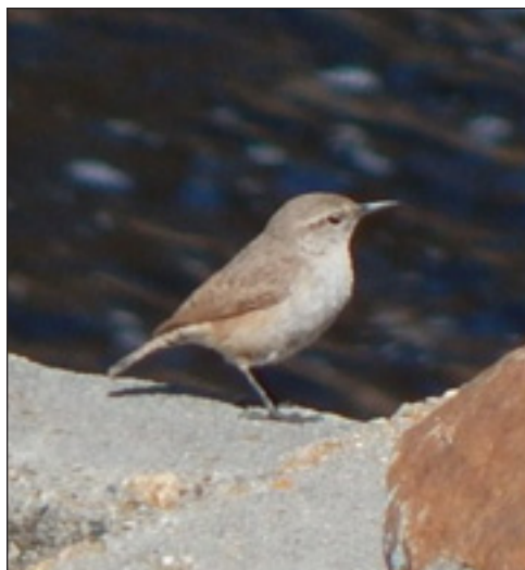
Record #2015-004, Rock Wren, 25 April 2015, Lake Bronson State Park, Kittson County.