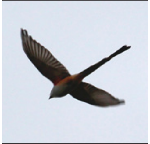
Record #2015-009, Scissor-tailed Flycatcher, 6 May 2015, Clay County.

• Ruff, 18 May 2015, Bass Ponds, Minnesota Valley National Wildlife Area, Hennepin County (record #2015-014, vote 7–0). Reeve.