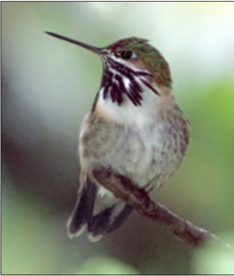
Calliope Hummingbird, 15 June 2016, Duluth, St. Louis County.