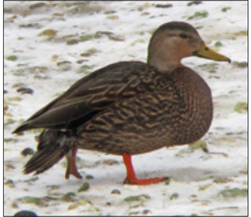
Mottled Duck, 15 February 2016, Rum River Dam, Anoka, Anoka County.

• Mottled Duck ( Anas fulvigula ), 15–16 February 2016, Rum River Dam, Anoka, Anoka County (record #2016-005, vote 10–0, origin vote 10–0). Adult male, photographed. First state record. The Committee also voted to accept the bird as wild. There are two genetically distinct and phenotypically identifiable subspecies of Mottled Duck: the Florida subspecies, A. f. fulvigula , occurring primarily in Florida, and the Western Gulf Coast subspecies, A. f. maculosa , which ranges from Alabama to south Texas and northeast Mexico. The bird was scrupulously researched and independently described by five observers. In addition, the Committee consulted an outside expert to further evaluate the question of hybridization. After discussion and deliberation,