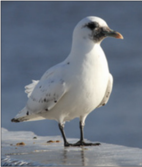
Ivory Gull, 3 January 2016, Duluth, St. Louis County.