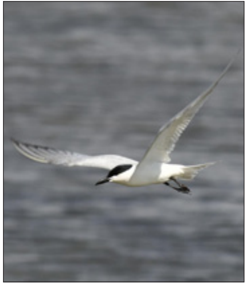
Gull-billed Tern, 1 June 2016, Salt Lake, Deuel County, SD.

southwest of Tracy, Lyon County (record #2016-017, vote 7-0). Adult, photographed. First county record.