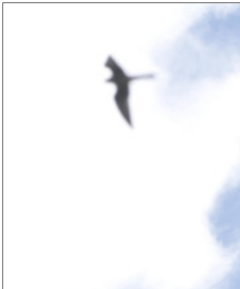
Record #2016-049, Fregata frigatebird, 21 August 2016, Mounds View, Ramsey County.

Cook Wastewater Treatment Ponds, St. Louis County (record #2016-042, vote 7–0). Photographed.