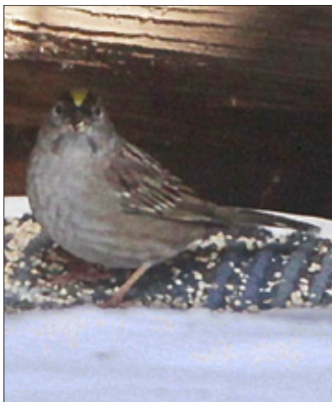
Record #2016-044, Golden-crowned Sparrow. 19 November 2016, Duluth, St. Louis County.

the observer. The only purpose is to highlight the difficulties an observer may encounter while identifying or documenting these and similar species.).