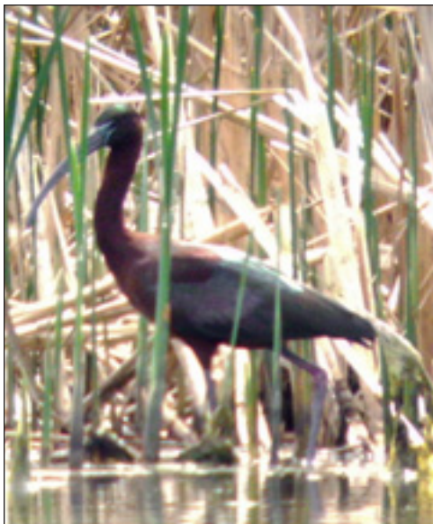
Record #2016-033, Glossy Ibis, 11 May 2016, Arthur Township, Traverse County.

micivorus ), 14 September 2016, private residence, Detroit Lakes, Becker County (record #2016-050, vote 7–0). Adult, photographed. The bird was seen at a feeder. Second state and first county record.