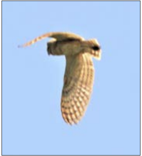
Barn Owl, 7 July 2017, Koester Prairie WMA, Dennison, Rice County.

lis, Hennepin County (record #2017-049, vote 0–7). The members who commented unanimously thought the bird was probably a Red-tailed Hawk.