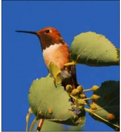
Rufous Hummingbird, 26 July 2017, Minneapolis, Hennepin County.

observer misidentified the bird or did not see it. Summaries of the reasons why a record was Not Accepted are included here. These are in no way intended to be critical of the observer. The only purpose is to highlight the difficulties an observer may encounter while identifying or documenting these and similar species.)