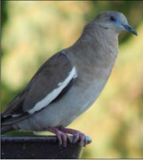
White-winged Dove, 28 July 2017, La Salle, Watonwan County.