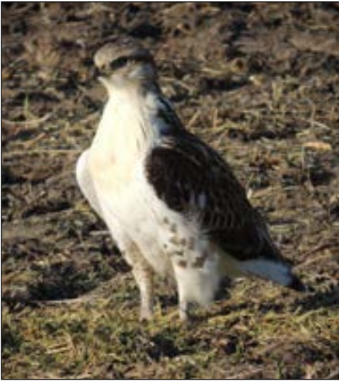
Ferruginous Hawk, 16 October 2017, Plummer, Red Lake County.