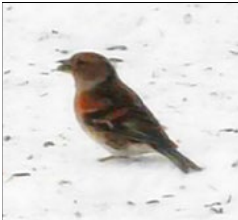
Brambling, 28 January 2019, Winona County.

007, vote 7-0). Adult male, photographed.