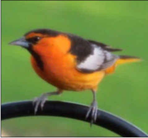
Bullock's Oriole, 10 May 2019, Sleepy Eye, Brown County.