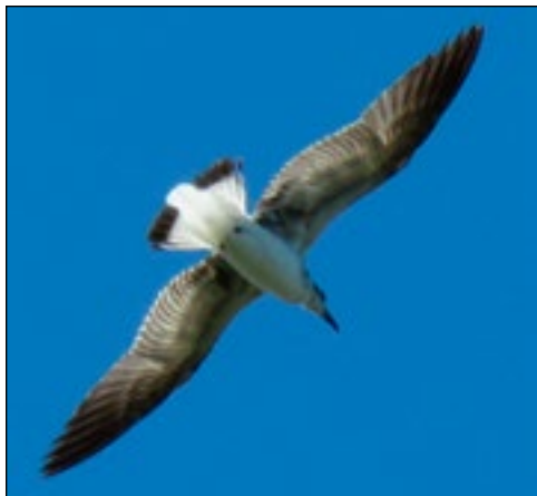
Laughing Gull, 13 June 2019, Wells, Faribault County.