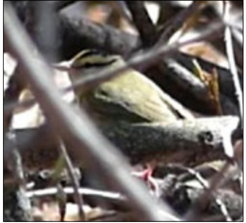
Worm-eating Warbler, 4 May 2018, Wayzata, Hennepin County.