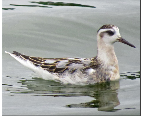
Red Phalarope, 14 September 2018, Cook Sewage Lagoons, St. Louis County.

• Red Knot 26 May 2019, Agate Bay, Two Harbors, Lake County (record #2019-038, vote 6-1). Adult, photographed.