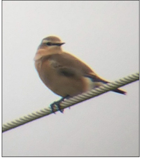
Northern Wheatear, 22 September 2019, Anandale Township, Wright County.

were Not Accepted. (Please note that a record which is Not Accepted only means that the documentation was not complete or convincing enough to include the sighting in The Loon , the journal of the Minnesota Ornithologists' Union (MOU), or in the MOU's archives of confirmed bird records. Such a vote does not necessarily mean the observer misidentified the bird or did not see it. These are in no way intended to be critical of the observer. The only purpose is to highlight the difficulties an observer may encounter while identifying or documenting these and similar species.)