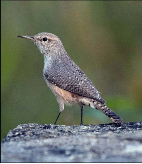
Rock Wren, 8 October 2019, Minnesota Valley NWR, Bloomington, Hennepin County.