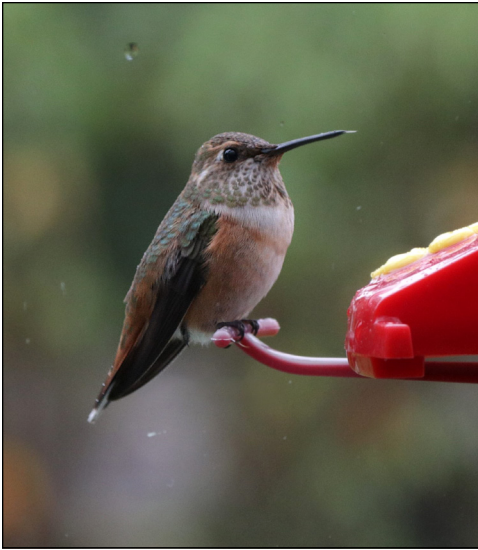
Rufous Hummingbird, 2 October 2019, Le Sueur, Le Sueur County.