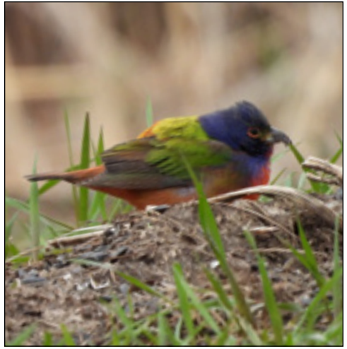
Painted Bunting , 24 April 2022, St. Charles, Winona County.