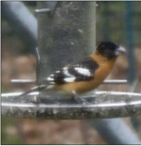
Black-headed Grosbeak , 9 May 2022, Coon Rapids, Anoka County.