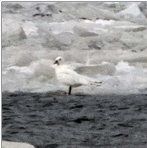
Ivory Gull , 8 January 2022, Duluth, St. Louis County.

County (record #2022-016, vote 7-0). Alternate-plumaged adult male, photographed. First county record.