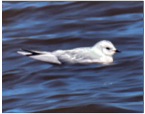
Ross's Gull, 31 May 2023, Lake Superior, St. Louis County.

• Black-necked Stilt , 8 May 2023, the intersection of Carver County Road 32 and Tacoma Avenue, Carver County (record #2023-039, vote 7-0). Pair of adults, photographed.