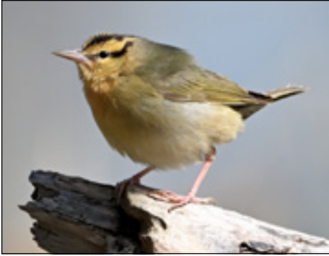
Worm-eating Warbler, 2 May 2023, Bass Ponds, Bloomington, Hennepin County.

Ivanhoe, Lincoln County (record #2023-049, vote 7-0). Adult, photographed. First county record.