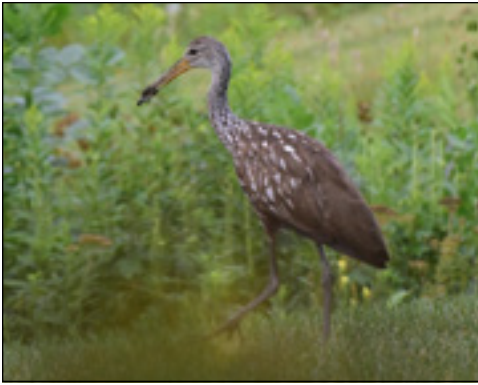
Limpkin, 6 August 2022, Lake George, Rochester, Olmsted County.