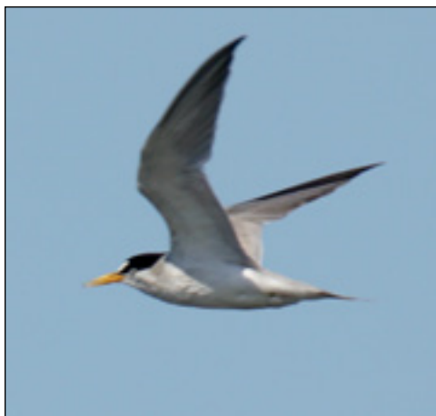
Least Tern, 19 July 2016, Toqua Township, Big Stone County.