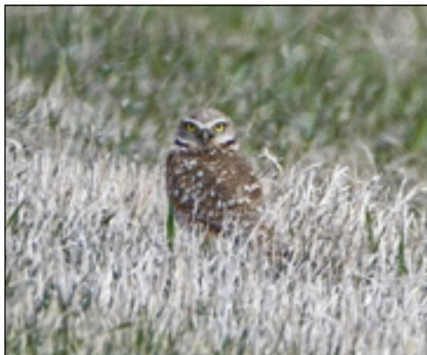
Burrowing Owl, 23 April 2023, Mulligan Township, Brown County.