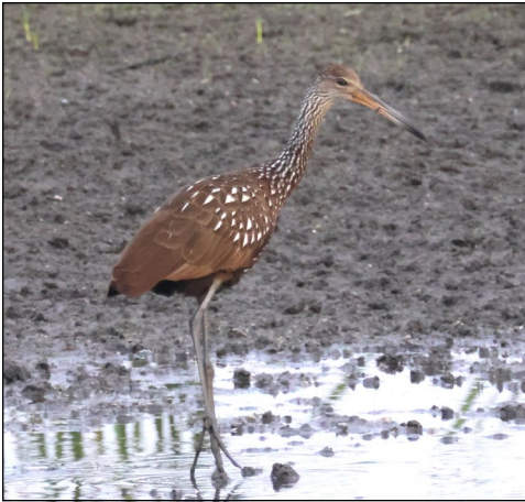
Limpkin, 25 September 2023, Middletown Township, Jackson County. Record #2023-102.