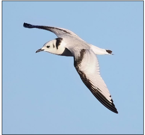
Black-legged Kittiwake, 19 November 2023, Taconite Harbor, Cook County. Record #2023-109.

2023, Palmers, St. Louis County (record #2023-122, vote 7-0). First cycle, photographed.