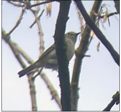
Vireo , sp., 16 May 2023, Lino Lakes, Ramsey County. Record #2023-088.

cies indistinguishable. Photographs were not diagnostic. The written descriptions among several birders had considerable variation regarding some features of the bird. Given the time span and distance of these reports, one might question whether they even represented the same bird. Overall, the Committee after much discussion unanimously concluded that the identification could not be assigned to a specific species of Thalasseus tern, but was accepted as Thalasseus sp.