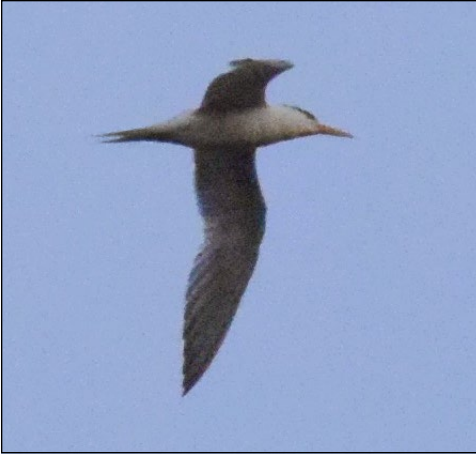
Thalasseus , sp., 21 September 2023, Stillwater, Washington County. Record #2023-085.