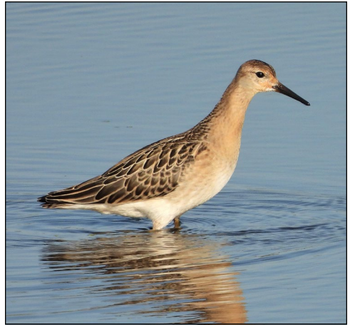
Ruff, 22 August 2023, Louriston Township, Chippewa County. Record #2023-096.

Two adults were accepted and photographed. Nesting was observed during this time period. Then on 2 August 2023 at the same location, three adults and three near-adults were reported, but these birds were not separately documented and no photographs were submitted to the Committee.