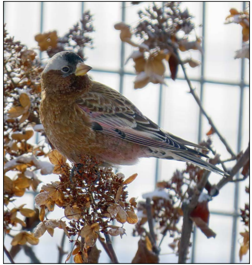
Gray-crowned Rosy-Finch, 17 January 2024, Deer River, Itasca County.

cord #2024-012, vote 7-0). Adult male, photographed.