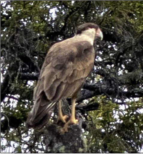
Crested Caracara, 9 June 2023, Castle Danger, Lake County.