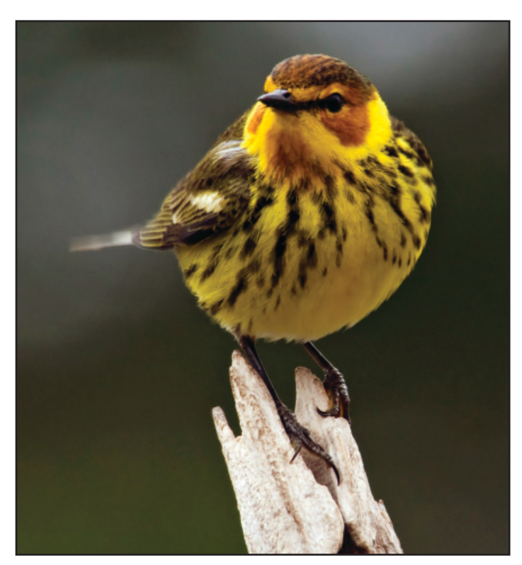
Cape May Warbler, by Earl Orf

To find local Audubon chapters and events near you, visit http://mn.audubon.org/audubon-locations. For an extensive list of events hosted by the Minnesota Department of Natural Resources, visit http://www.dnr.state.mn.us/events/index.html.