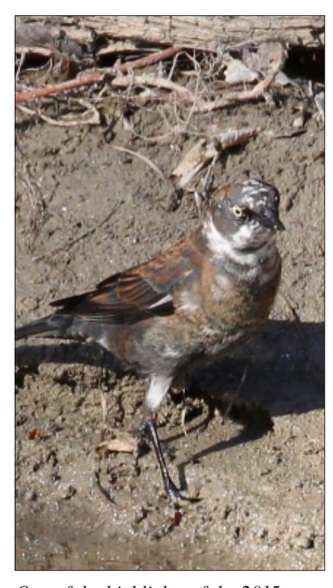
One of the highlights of the 2015 blitz was this leucistic female Rusty Blackbird, found and photographed in Moorhead by Kara Susag.

The Rusty Blackbird Spring Migration Blitz (RBSMB) is a three-year coordinated survey led by the International Rusty Blackbird Working Group (IRBWG), along with eBird, the Cornell Lab of Ornithology, and the Vermont Center for Ecostudies. Participants will be collecting data throughout the migratory range of the species, extending from the southern United States through the Midwest and Atlantic Coast and all the way into Canada. The objectives of the RBSMB are to 1) determine important migratory stopover sites, 2) assess consistency of use and timing at stopover locations, 3) strengthen relationships with other conservation organizations and enhance the conservation of Rusty Blackbirds, and 4) increase awareness of Rusty Blackbirds among the birding community and general public.