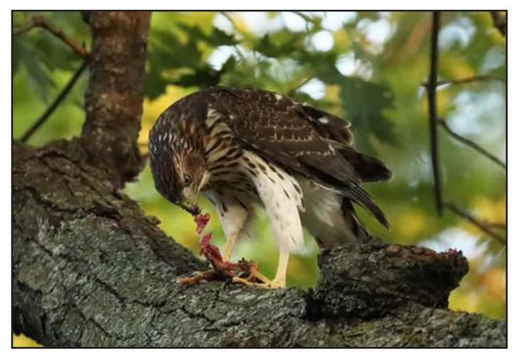
Cooper's Hawk

our Facebook page: www.facebook.com/MNornithU/. Read about a recent scientific study in The Loon or peruse an article about bird conservation in this very newsletter, Minnesota Birding . Never seen a Lesser Yellowlegs before? Check out our list of guided field trips in this same newsletter. As MOU members, we want others to understand why birds are so important, and this is achieved by disseminating information about birds.