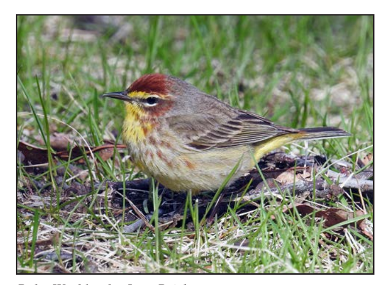
Palm Warbler

So what are some needs that can be met by volunteering under the MOU umbrella? Perhaps first and foremost, the dissemination of information on birds in Minnesota. From our database managers to our many members who faithfully staff the MOU State Fair booth each year, the expertise of our membership is invaluable in teaching others about birds. Want to learn something new about birds? Check out