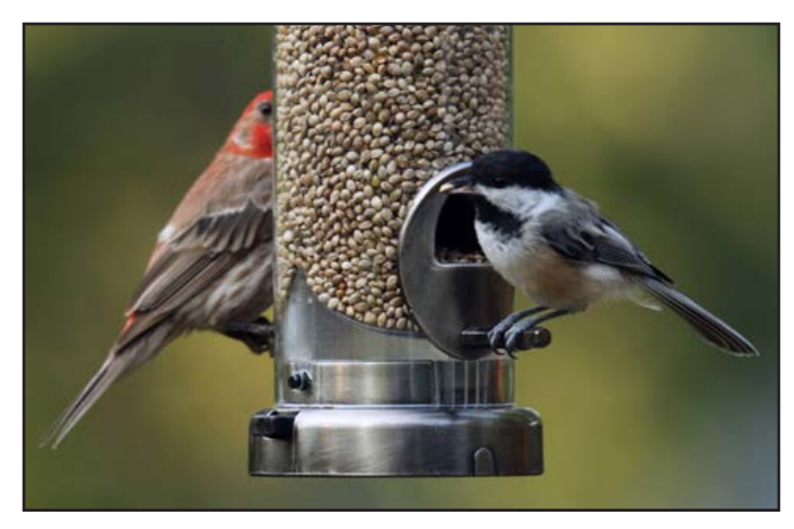
House Finch and Black-capped Chickadee at hemp feeder, by Carrol Henderson

value as fiber for producing high quality textiles. Hemp is being widely grown across Canada, where there are 12 different varieties for differing product benefits.