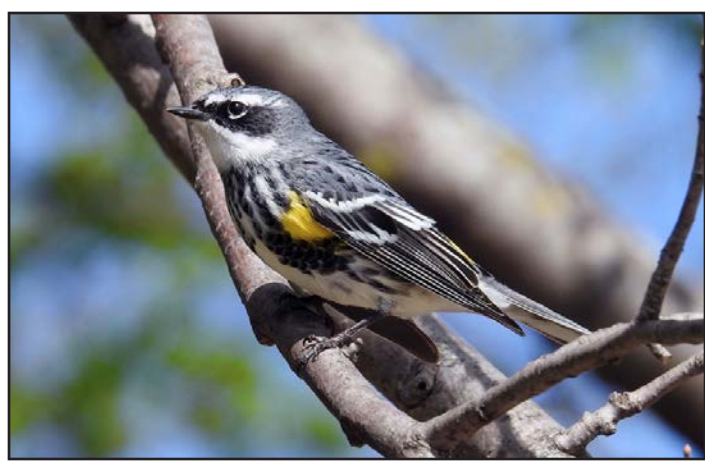
Yellow-rumped Warbler, by Jean Brislance