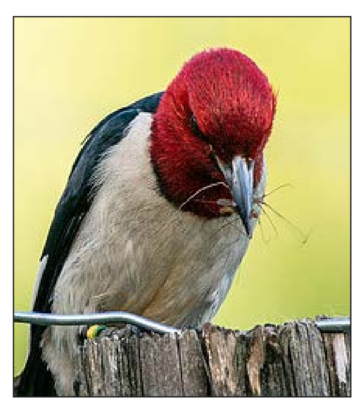
Red-headed Woodpecker