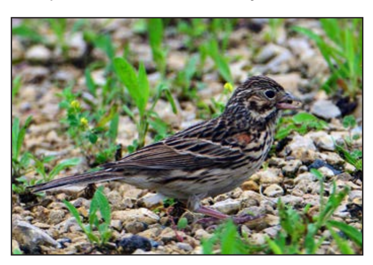
Vesper Sparrow