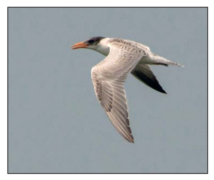
Caspian Tern

Saturday, December 1, 2018, 9 AM - 4 PM Northstar Ballroom in the student center of the St. Paul campus, University of Minnesota 2017 Buford Ave, St Paul, MN 55108 Featuring tours of the Bell Museum and Raptor Center! Additional details and program to follow on our website, MOU-net, and our Facebook page.