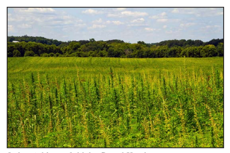
Industrial hemp field, by Carrol Henderson

Meanwhile, the potential for avian use of hemp seed offers some bonus environmental benefits. This is a crop that could be locally grown by Minnesota farmers. In contrast, bird foods like nyjer are grown in Africa, India, and southeast Asia and must be imported. Furthermore, hemp plants are resistant to traditional insect pests, so pesticides and insecticides are not necessary. The tiny flowers of hemp plants are also visited by small pollinator insects, including native species.