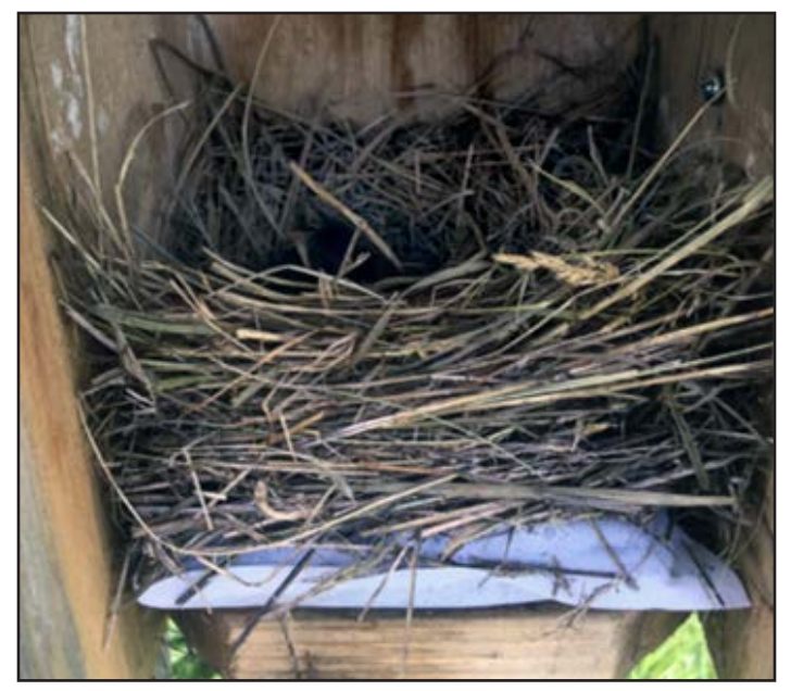
The inside of a nest box used in the study

After the nests were assigned to a treatment Lauren took growth measurements, fecal samples, and blood samples from the nestlings when they were five and 10 days old. These measurements, as well as blood samples, will be used for immunological analysis to see how the experimental manipulation of temperature affected the nestlings' immune system. Lauren also took growth measurements, fecal samples, and blood samples from adult birds when nestlings were around