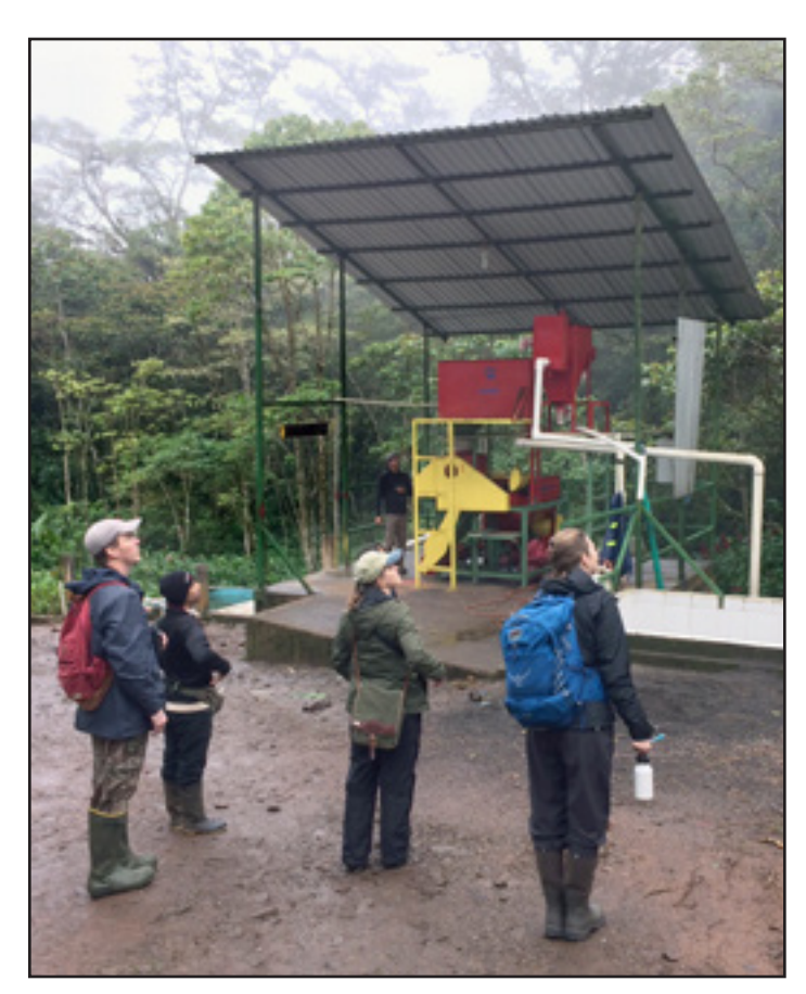
Author and colleagues observing birds at a coffee plantation/cloud forest reserve in Nicaragua

There is a strong link between birds of Minnesota and the highlands. Fifty Minnesota breeding species spend the nonbreeding season in highland forested habitats, including many common ones like Ruby-throated Hummingbird, Baltimore Oriole, and Gray Catbird (see Table 1 for a list).