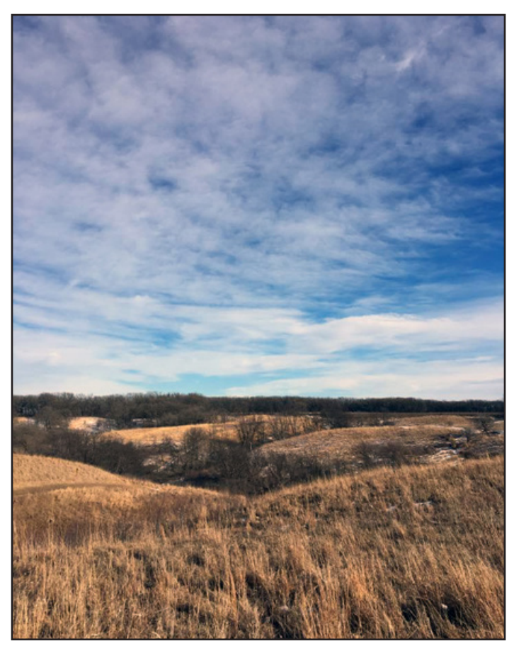
Kilen Woods State Park prairie

Like much of the state, southwest Minnesota has experienced very wet conditions during the past few years,