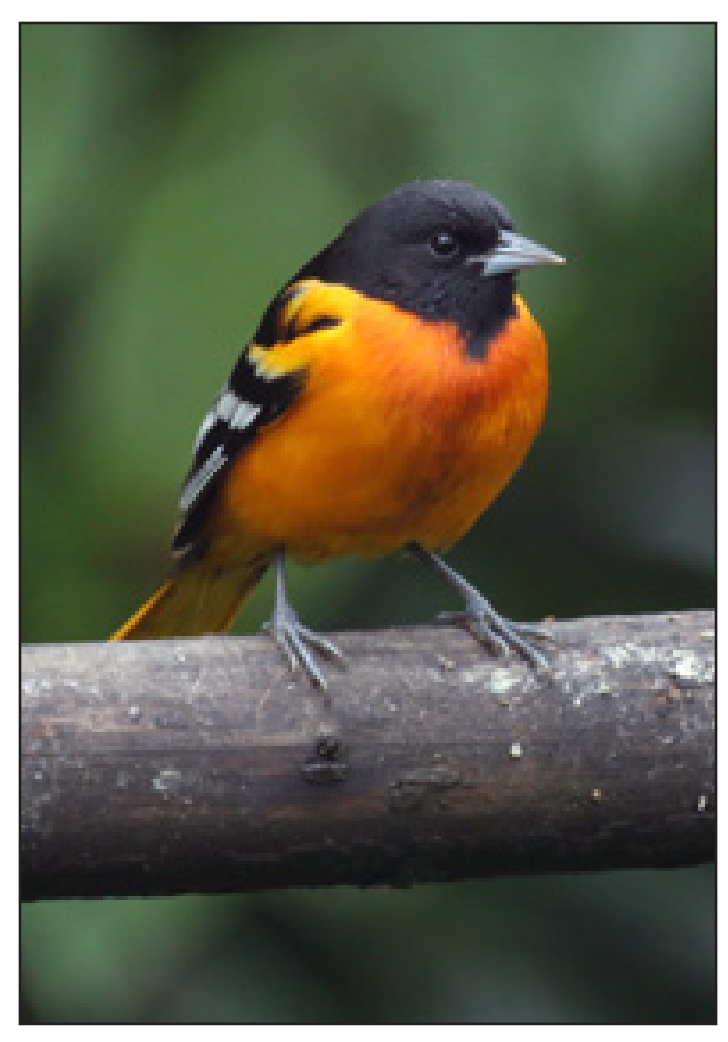
Baltimore Oriole visiting a fruit feeder in Nicaragua

this for a second, and ponder the population-level impact on Wood Thrushes of an acre of forest lost on the wintering grounds vs. here. While the species needs habitat in both places (and in between) to survive, the urgency of protecting habitat on the wintering grounds can't be overstated.