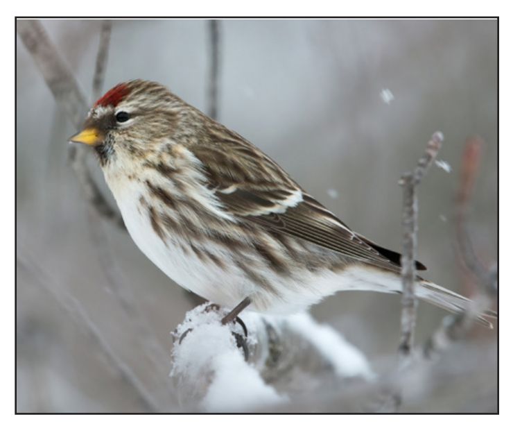
Common Redpoll