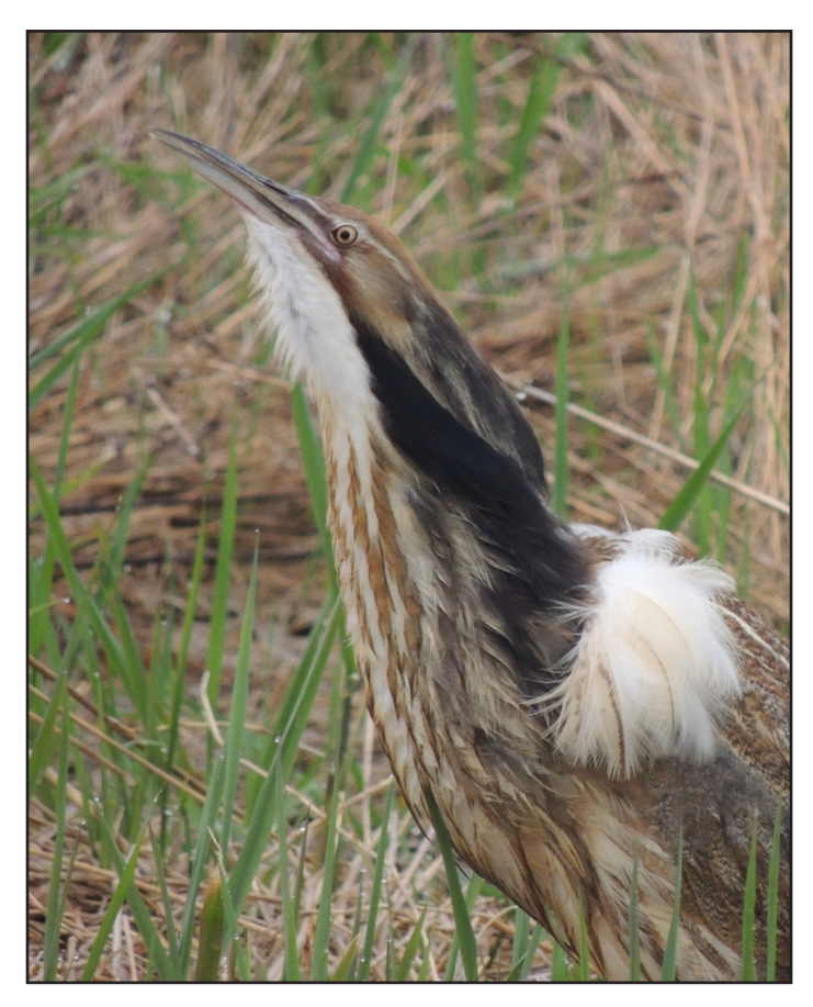
American Bittern