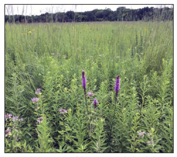
Emrick Prairie, one of the prairies studied in the project

While these data provide good preliminary evidence that FMRs prairie restoration projects are successful in providing habitat for prairie-dependent bird species, additional research is needed to evaluate nest success and determine actual population effects. Additional data analysis of bird guilds or other parameters could also be done to better understand more specific habitat niches that are being utilized and potential gaps."