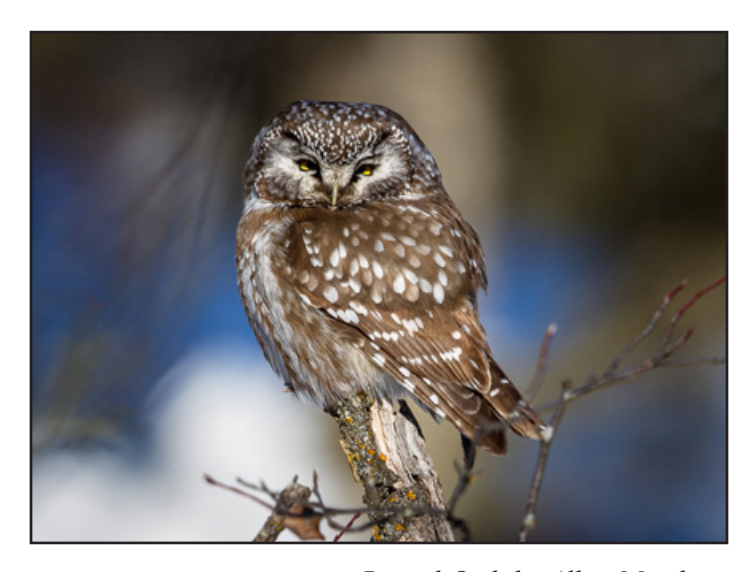
Boreal Owl, by Allan Meadows

Details: 7 pm – 9 pm. This time of the year, many of the Midwest's 12 owl species are vocalizing to attract mates. Explore CNC on a guided night hike to look and listen for these owls. If there is enough snow cover, snowshoes will be provided or you may bring your own. Program Fee: $6.00 per person or $4.00 for "Friends of CNC." Please call 651-437-4359 register. Location: Minnesota Campus