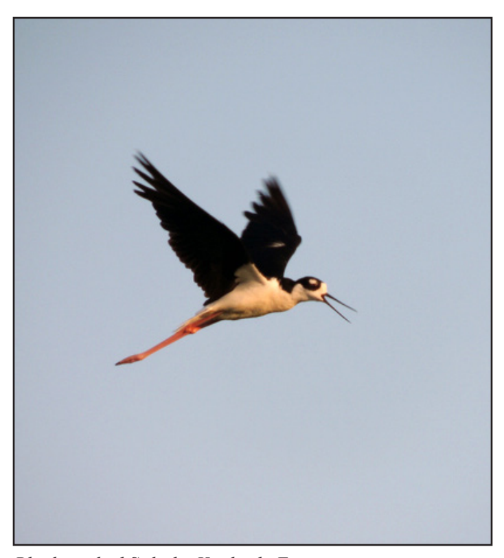
Black-necked Stilt, by Kimberly Emerson

U.S. Highway 71 for 2.5 miles, then take a left onto Jackson County Road 36. The WPA will be two miles east, on the south side of the road. The north-south road that bisects the wetland is 520<sup>th</sup> Avenue.