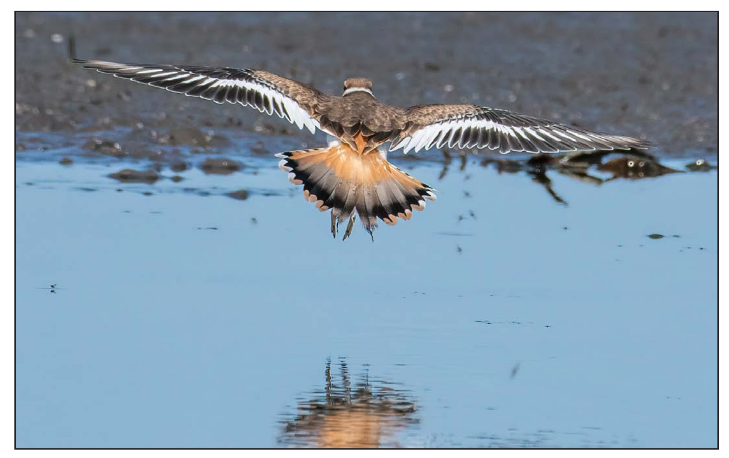
Killdeer

u A plover reported in Minnesota but not accepted