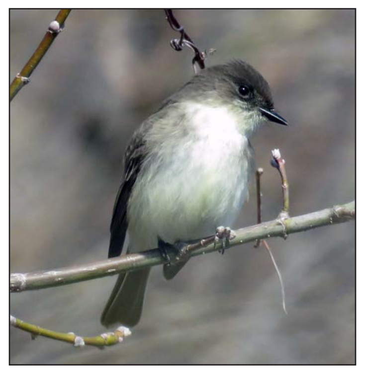
Eastern Phoebe, by Dana Sterner