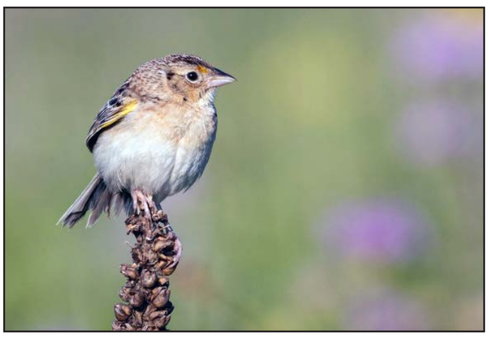
Grasshopper Sparrow