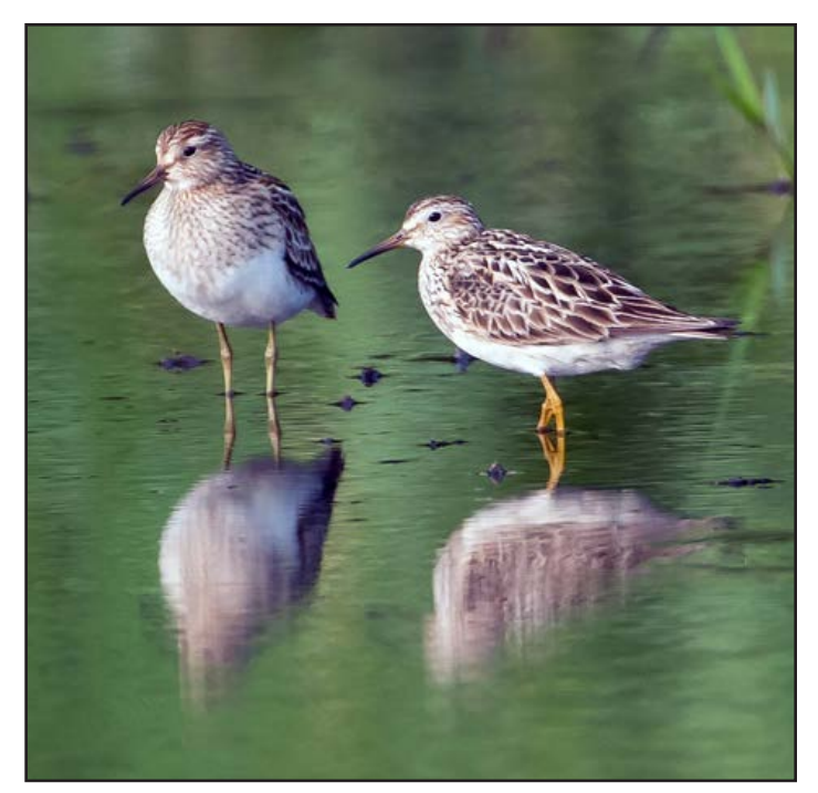
Pectoral Sandpipers, by Gerald Hoekstra

feed at upwellings and alongside feeding whales, occasionally picking parasitic lice off of the backs of the giants.