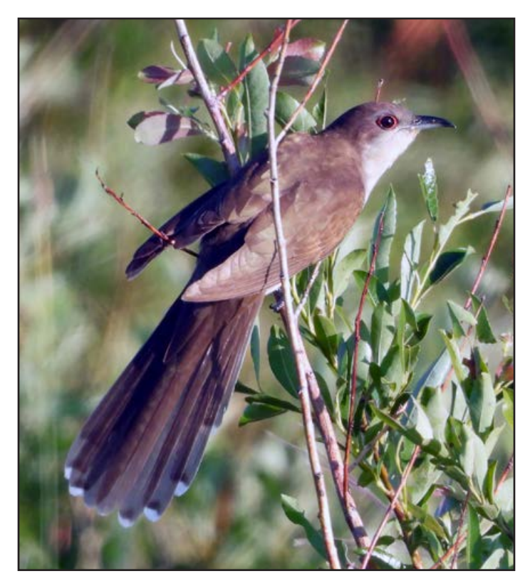
Black-billed Cuckoo