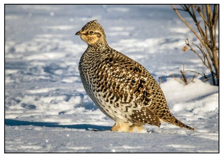
Sharp-tailed Grouse

Details : 8 am–4 pm. Celebrate birds and conservation at the Hastings area Earth Day Birding Festival. This is the sixth year the Hastings Environmental Protectors has teamed up with CNC for the Birding Festival. Participate in the Youth Birding Competition. Attend classes and demonstrations that introduce you to raptors, birding, and bird banding. Go on guided bird trips in the Hastings area. To learn more about the day's events, visit the festival website. Event fee is $5 or $15 with a box lunch. RSVPs are required; call 651-437-4359 to reserve your spot.