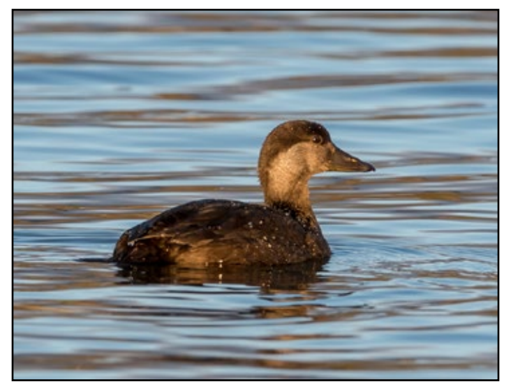
Black Scoter

needed. Their courtship dance is one of the most elaborate of any North American bird. And look closely at those Western Grebes, because Lake Osakis is one of the best places to find Clark's Grebe in Minnesota. Be careful, though: hybrids are possibly just as common on the lake as pure birds. Many of the pure Clark's have nested with Westerns, creating offspring with features that are intermediate between the two species. Pied-billed Grebes also nest on the lake. While I've tried to find nesting Eared Grebes on the lake, I haven't been successful. I have found Eared Grebes nesting in Osakis, though, just south of town on Clifford Lake. So, it is entirely possible to find five nesting species of grebes in Osakis in one day!