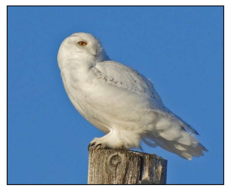
Snowy Owl, by Doug Kieser