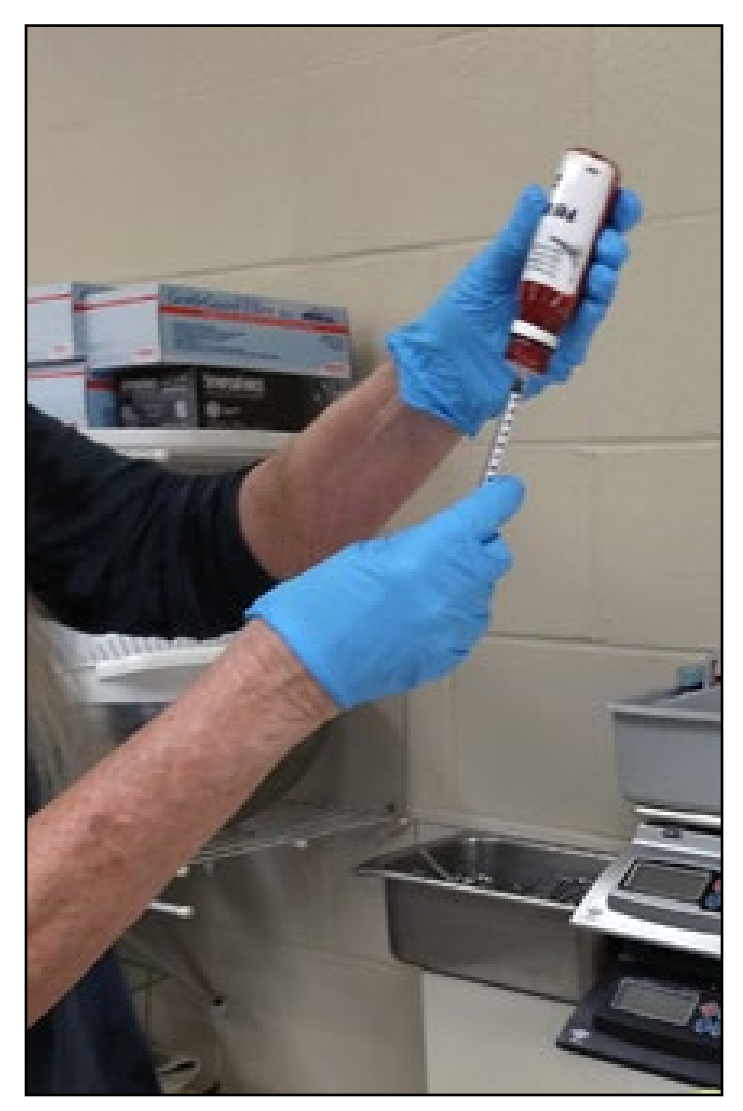
Morning clinic volunteers prepare food and medications for each patient, as prescribed on the patient charts.

Linda Whyte is a retired teacher, living in St. Paul, who birds mostly in the metro area, and in outstate Minnesota when possible.