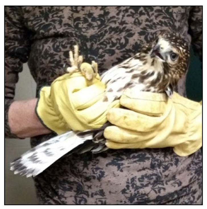
A Broad-winged Hawk being brought from its flight room to the treatment room for assessment

Most volunteers would agree that the pinnacle of interest and satisfaction—and the area requiring the most training and practice—is bird-handling. Prior experience