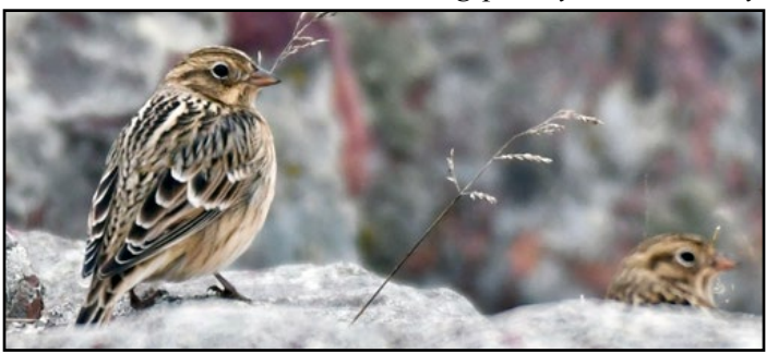
Smith's Longspur