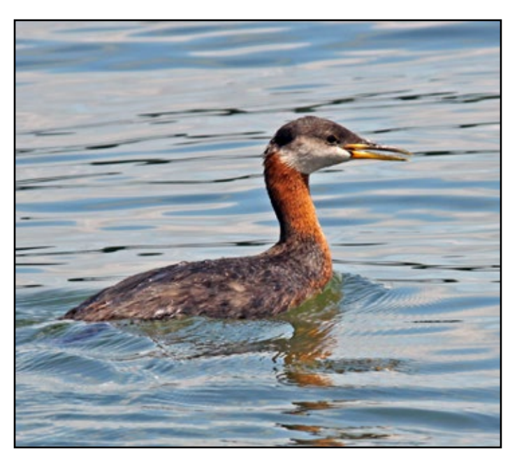
Red-necked Grebe

Spring migration on the lake is a wonderful time, with hordes of waterfowl, gulls, terns, warblers, and shorebirds. This is the best place in Todd County to find migrating geese like Snow and White-fronted and it's hand down the