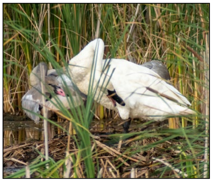
Trumpeter Swans in a Kandiyohi Wetland, by Gerald Hoekstra

While they are rare in Minnesota, several species of sea ducks occur in Minnesota. White-winged, Surf, and Black Scoters and Long-tailed Ducks are all regularly seen