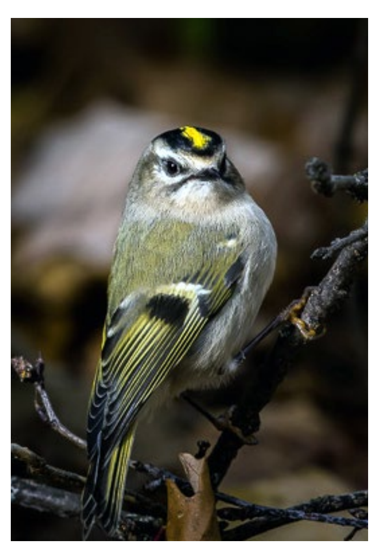
Golden-crowned Kinglet, by Allan Meadows

Warblers, Kinglets, Vireos, Flycatchers, Hummingbirds Ovenbird, Louisiana Waterthrush, Northern Waterthrush, Golden-winged Warbler, Blue-winged Warbler, Black-andwhite Warbler, Prothonotary Warbler, Tennessee Warbler, Orange-crowned Warbler, Nashville Warbler, Connecticut Warbler, Mourning Warbler, Kentucky Warbler, Common Yellowthroat, Hooded Warbler, American Redstart, Cape May Warbler, Cerulean Warbler, Northern Parula, Magnolia Warbler, Bay-breasted Warbler, Blackburnian Warbler, Yellow Warbler, Chestnut-sided Warbler, Blackpoll Warbler, Black-throated Blue Warbler, Palm Warbler, Pine Warbler, Yellow-rumped Warbler, Black-throated Green Warbler, Canada Warbler, Wilson's Warbler, Bell's Vireo, Yellow-throated Vireo, Blue-headed Vireo, Philadelphia Vireo, Warbling Vireo, Red-eyed Vireo, Blue-gray Gnatcatcher, Golden-crowned Kinglet, Ruby-crowned Kinglet, Great Crested Flycatcher, Western Kingbird, Eastern Kingbird, Olive-sided Flycatcher, Eastern Wood-Pewee, Yellowbellied Flycatcher, Acadian Flycatcher, Alder Flycatcher, Willow Flycatcher, Least Flycatcher, Eastern Phoebe, Say's Phoebe, Ruby-throated Hummingbird