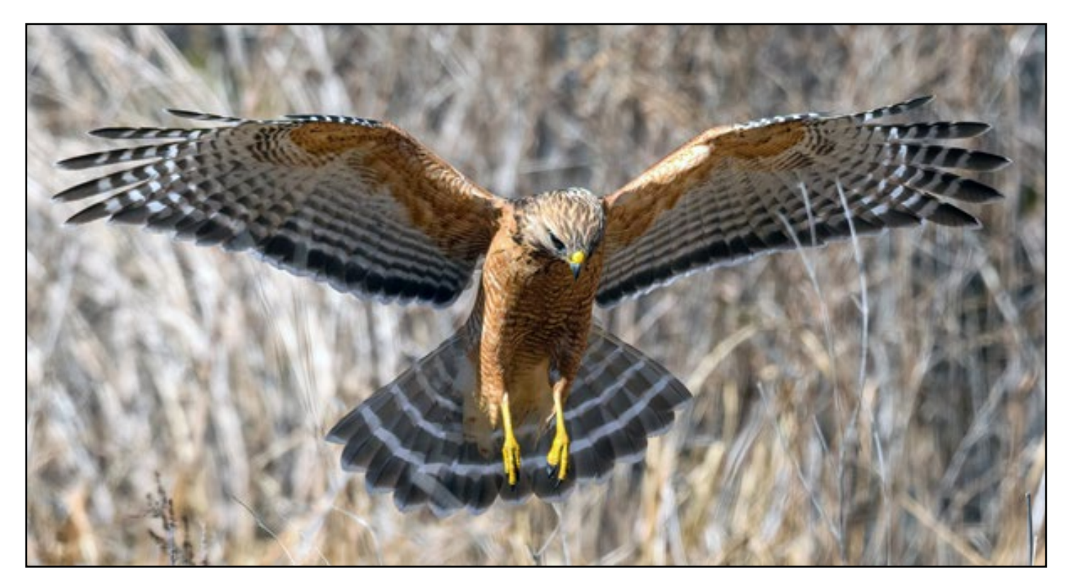
Red-shouldered Hawk