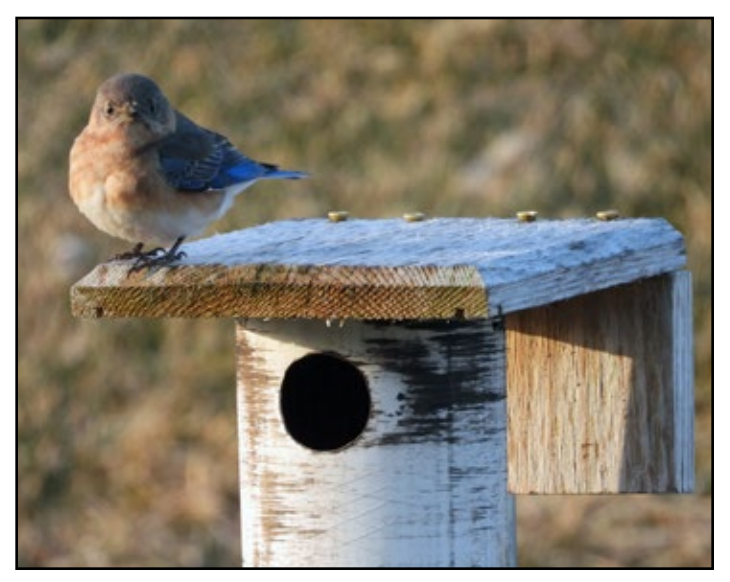
Eastern Bluebird, by Ben Douglas

had created in order to plan big watch events and big hike events for 2020, so I decided to take a shot at virtually gathering everyone that I could for a homebound event focused on social interaction, camaraderie, and common interest—a group Big Day of home-area birding.