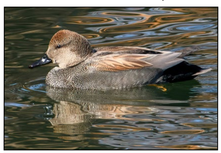
Gadwall

Sandhill Crane, Yellow Rail, Virginia Rail, Sora, Common Gallinule, American Coot, White-faced Ibis, American Avocet, Black-bellied Plover, American Golden-Plover, Killdeer, Semipalmated Plover, Piping Plover, Upland Sandpiper, Whimbrel, Hudsonian Godwit, Marbled Godwit, Ruddy Turnstone, Red Knot, Stilt Sandpiper, Sanderling, Dunlin, Baird's Sandpiper, Least Sandpiper, White-rumped Sandpiper, Buff-breasted Sandpiper, Pectoral Sandpiper, Semipalmated Sandpiper, Short-billed Dowitcher, Long-billed Dowitcher, American Woodcock, Wilson's Snipe, Spotted Sandpiper, Solitary Sandpiper, Lesser Yellowlegs, Willet, Greater Yellowlegs, Wilson's Phalarope, Red-necked Phalarope, Sabine's Gull, Bonaparte's Gull, Little Gull, Franklin's Gull, Ring-billed Gull, Herring Gull, Iceland Gull, Lesser Black-backed Gull, Glaucous Gull, Great Blackbacked Gull, Caspian Tern, Black Tern, Common Tern, Forster's Tern