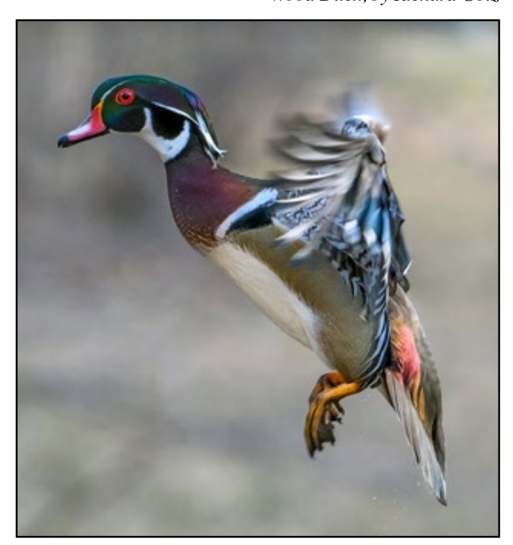
Wood Duck

Our group chat was an amazing chorus of shared experience and teamwork. I merged our sightings into a single checklist and reported back where we stood as a group. Par-