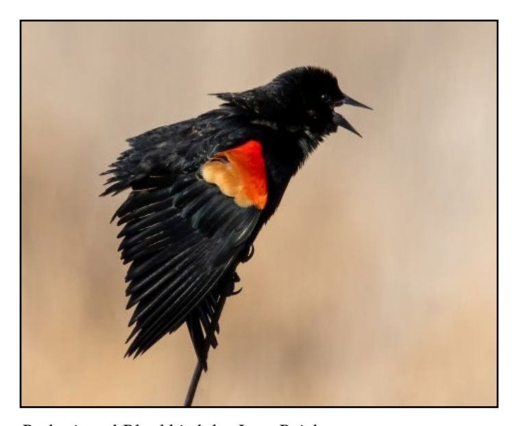
Red-winged Blackbird